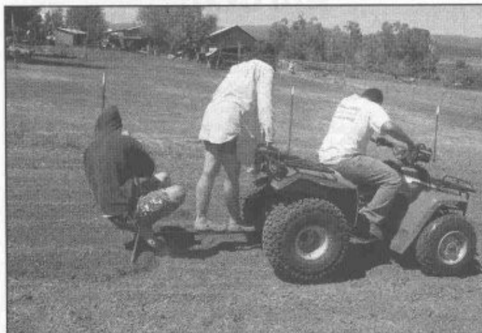
For nice straight garden rows, you can't beat this homemade row marker (see plan on next page). Above: Apparently no one above wants to face the camera, and we don't blame them. Rigging a weight to the bar would be much safer.